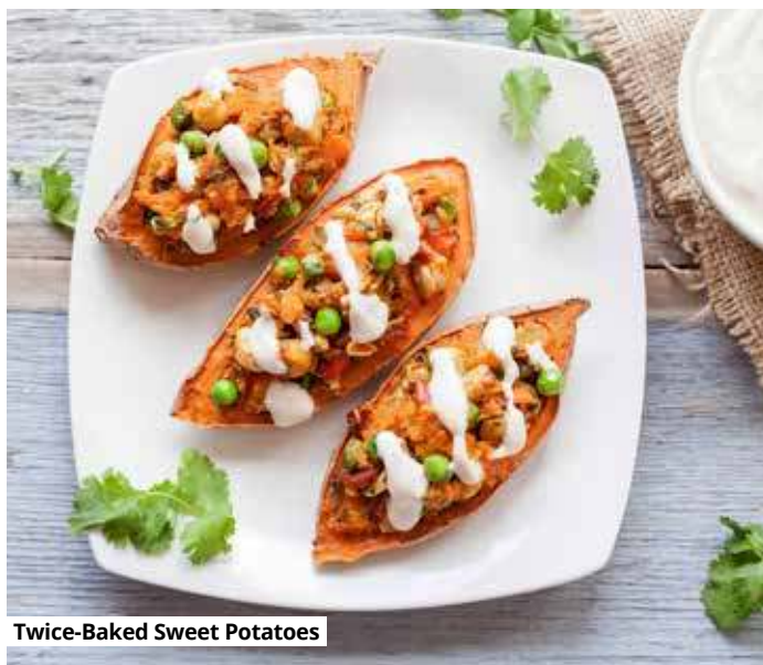
Twice-Baked Sweet Potatoes