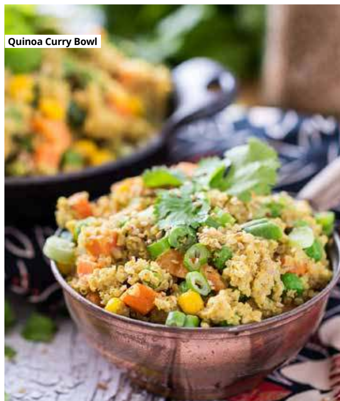
Quinoa Curry Bowl

Worrying about eating only fresh, local, or organic foods is folly when you consider that you were eating fast food and Ring Dings a few weeks ago. Since choosing whole plants is the most important thing you can do for both your health and the world around us, be sure that priority is well taken care of before seeking loftier goals.