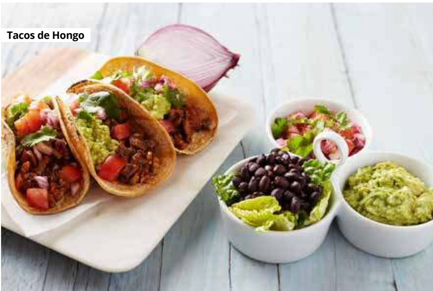
Tacos de Hongo