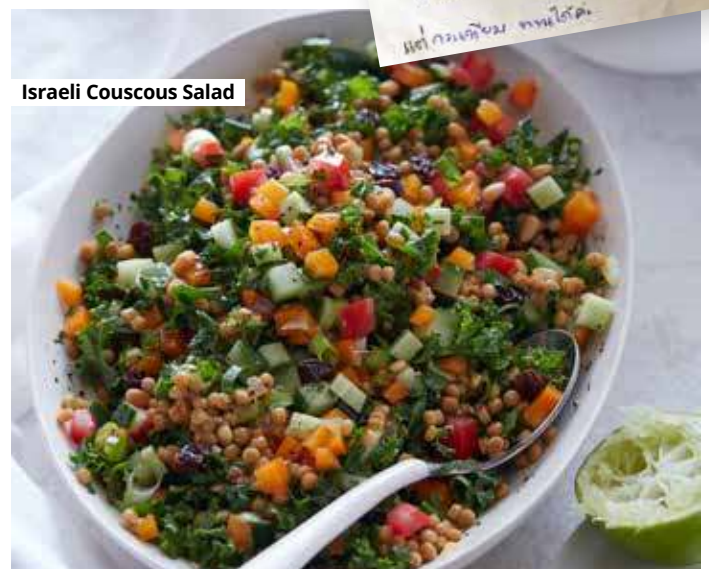
Israeli Couscous Salad